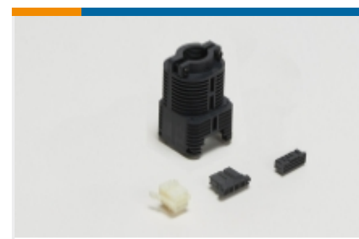
Rectangular Connector Housings(12)